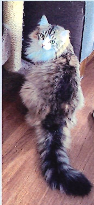
Elegant Egwene posing for the camera.