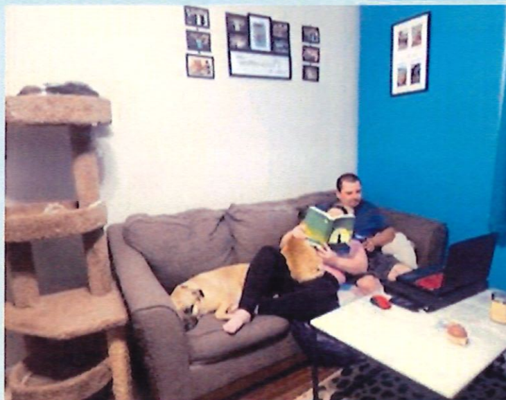
Reading, and relaxing makes for a great weekend. If a "cuddle puddle" was an Olympic sport, we would be medalists. There is always more room.