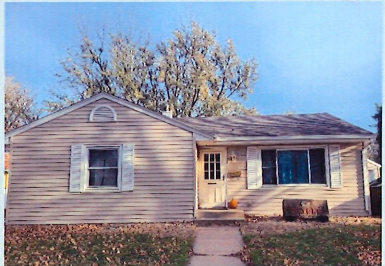
Our home in eastern South Dakota.