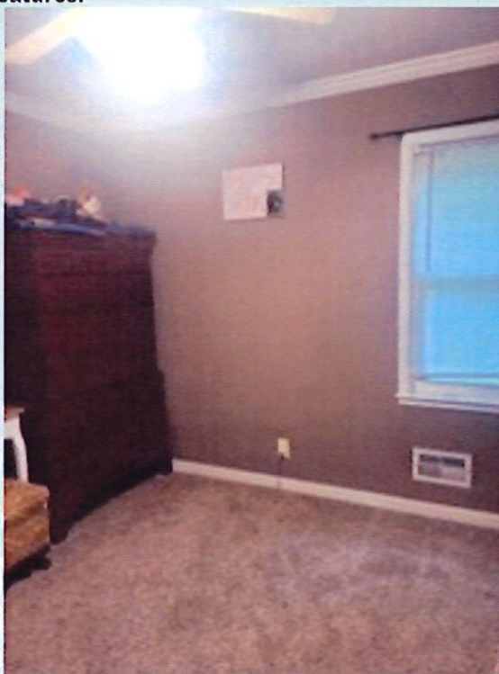
We plan for this to be the baby's room!