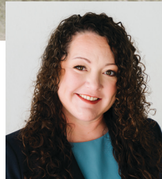
Lutheran House of Mercy

Thank you for being a vital part of where we've been and where we're going.