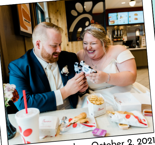
We got married on October 2, 2021. We spent the next couple years traveling and building our marriage!