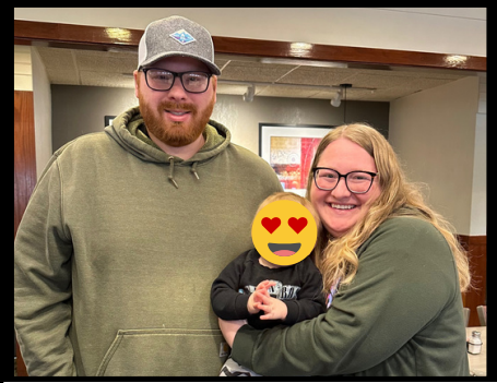
Hobbies I enjoy are building computers, gaming, board/card/yard games, 3D printing, chillin' with my cats, and watching TV.