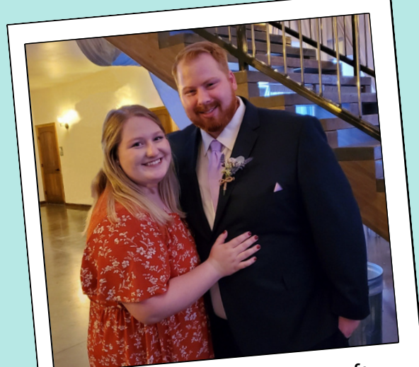
We began dating in 2019 after meeting online!