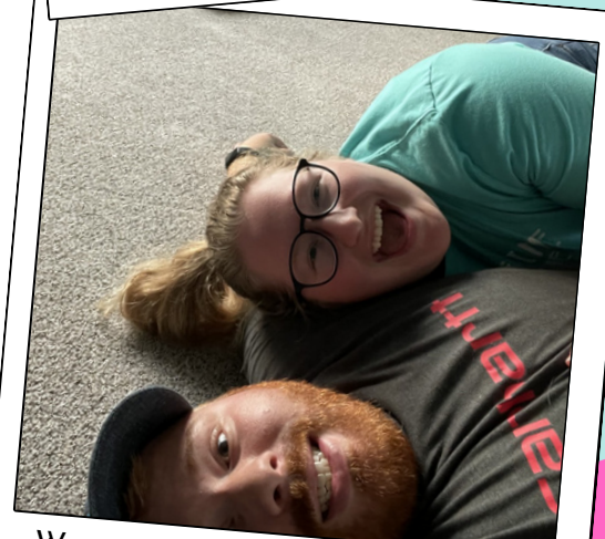
We moved into our home a couple months before the wedding and worked on improvements to make it "ours".