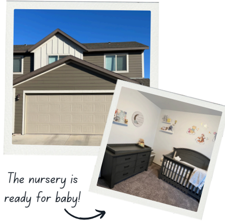
The nursery is ready for baby!