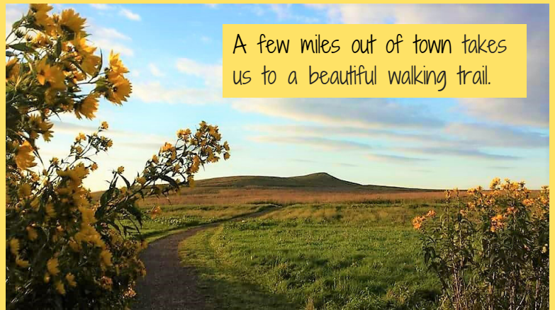
A few miles out of town takes us to a beautiful walking trail.