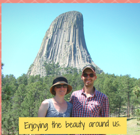
Enjoying the beauty around us.