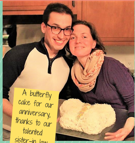
A butterfly cake for our anniversary, thanks to our talented sister-in law.