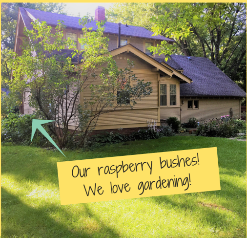
Our raspberry bushes! We love gardening!

We are centrally located in town and very close to many places. We're a short walk to best local pizza joint, summer ice cream parlor, independent movie theater, and our amazing public library. Our favorite park and the elementary school are both just 6 blocks from us.