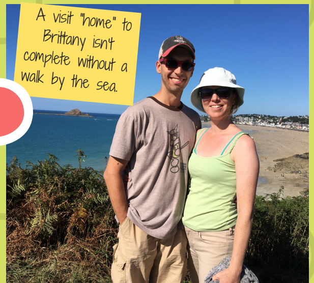
A visit "home" to Brittany isn't complete without a walk by the sea.