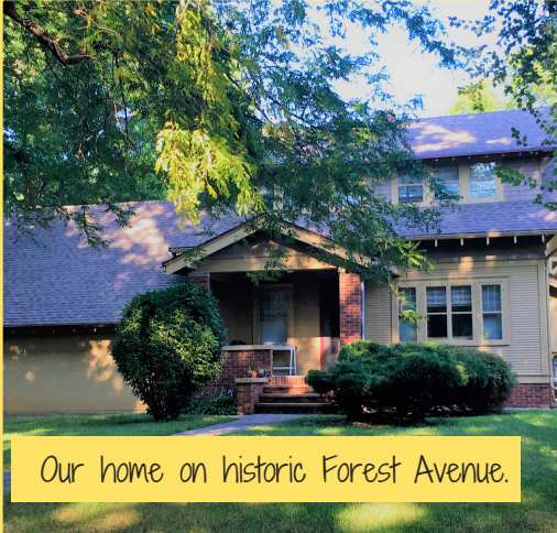
Our home on historic Forest Avenue.

We live on a welcoming little street, aptly named Forest Avenue. We love the history of the homes here and enjoy the diversity and charm of the people drawn to this neighborhood.