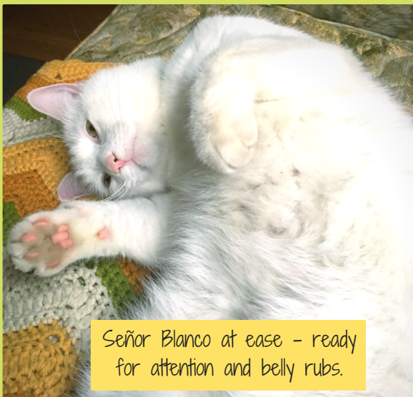
Señor Blanco at ease - ready for attention and belly rubs.