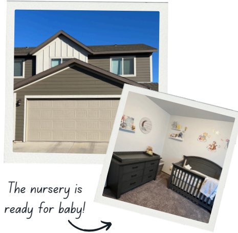
The nursery is ready for baby!