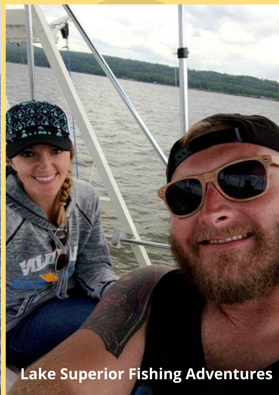
Lake Superior Fishing Adventures