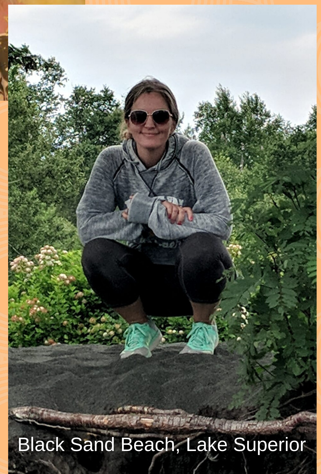
Black Sand Beach, Lake Superior