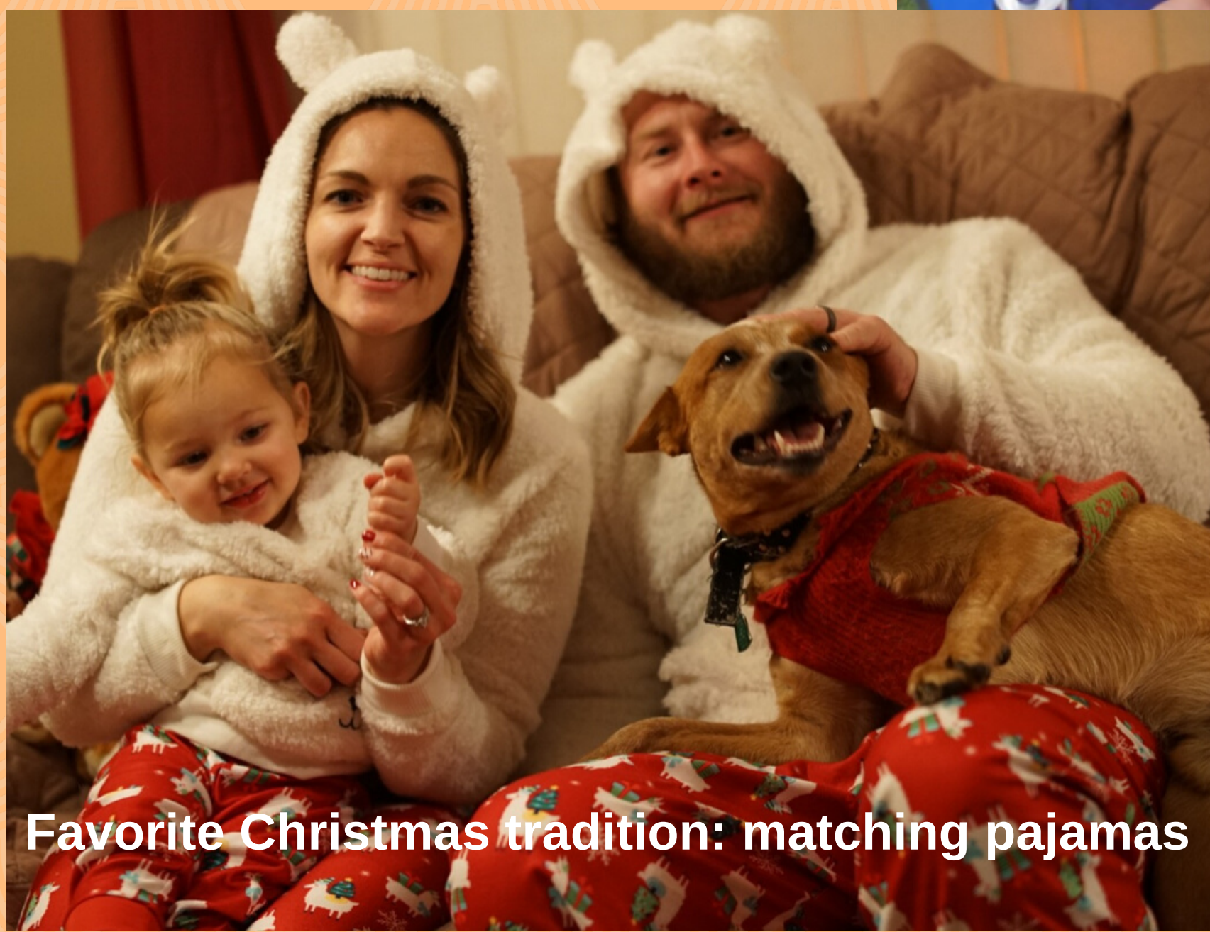
Favorite Christmas tradition: matching pajamas