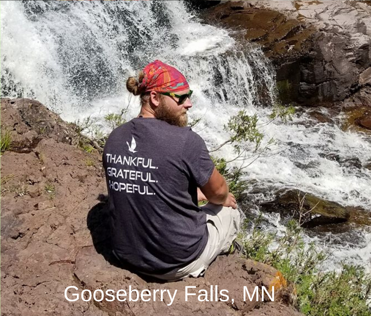
Gooseberry Falls, MN