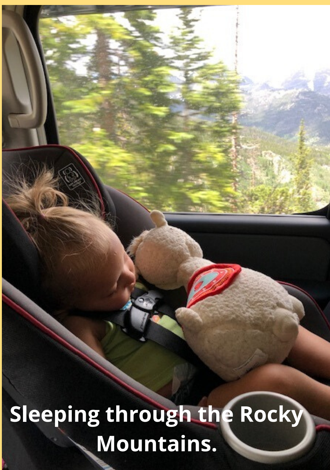
Sleeping through the Rocky Mountains.