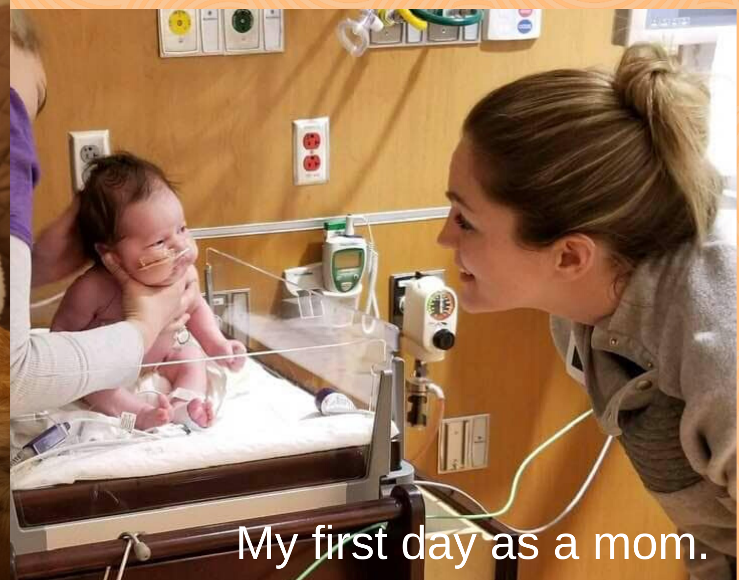
My first day as a mom.