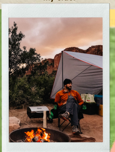
Camping in Moab!