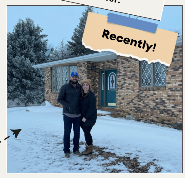
In January of 2024 we purchased a farm. We look forward to creating a lifetime of memories here as a family!

After a year of dating we were engaged in 2016! Sloane moved from Nebraska to South Dakota shortly after.