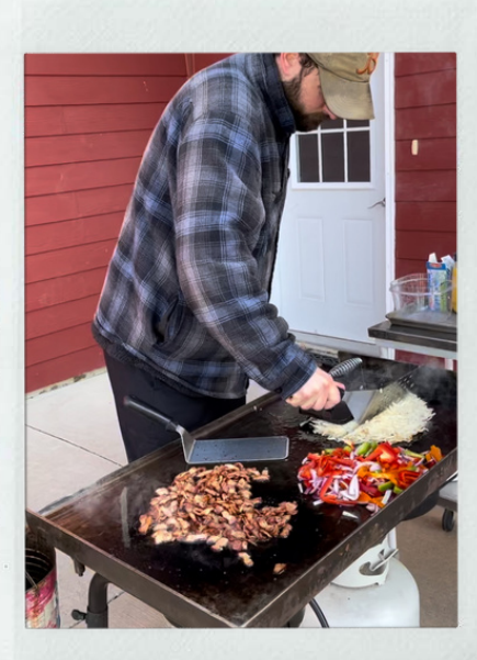
Cooking brunch for family visitors.