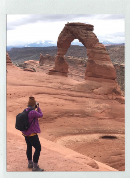
Photographing Delicate Arch in Moab

In 2020, she switched gears and is now a business owner. This allows her the ability to be a stay-at-home parent when the time comes.